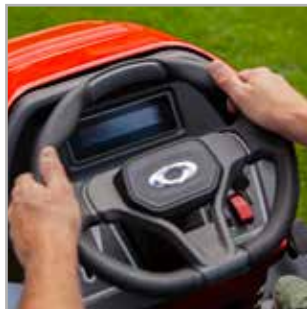
STYLISH CONTROL PANEL The deluxe dashboard hosts a LED display, 2 USB ports, RMO switch, parking brake, cruise control, automatic mower shut off and throttle lever.