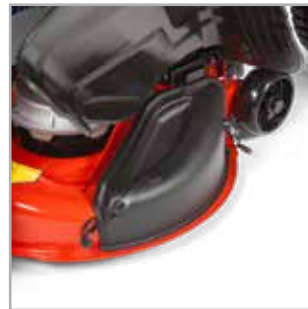
MULCHING COVER INCLUDED The SRE96 includes a mulching cover for efficient grass recycling.