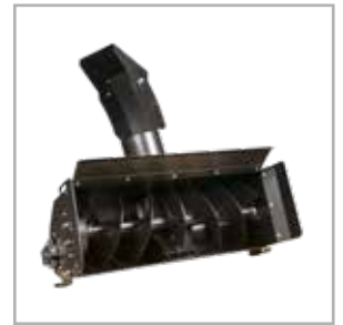
Snow thrower 100 cm (SYC)