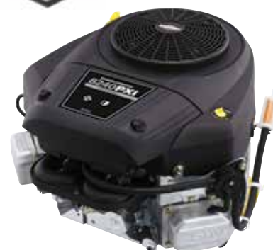
BRIGGS & STRATTON® ENGINE The Briggs & Stratton PXi engine features an oil filter and pressure lubrication.