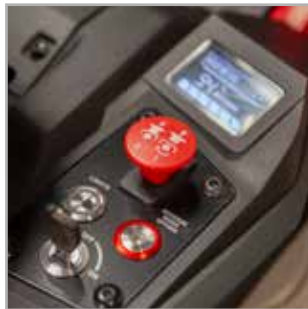
INTUITIVE CONTROL LAYOUT A compact LED information display sits on your right-hand side just above the ignition key, giving you all the essential information at a glance.