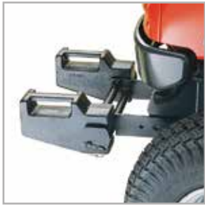
Weight carriers front / rear