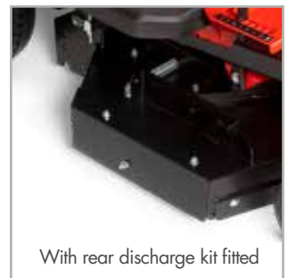
With rear discharge kit fitted