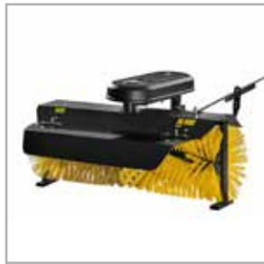
Sweeping brush 120 cm (SYC)