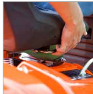
ADJUSTABLE SEAT The premium high-back seat can easily be adjusted with a lever to provide plenty of legroom.