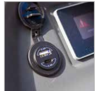
USB CHARGER PORT The dashboard houses both a USB-A and USB-C charger port each delivering 2,4 A maximum.