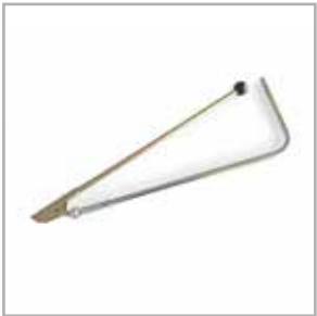
Discharge Tunnel Scraper (SLC & SYC)