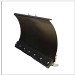
Snow blade 120 cm (SLC & SYC)