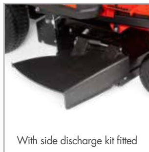
With side discharge kit fitted