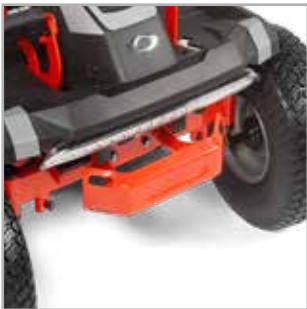
INTEGRATED LED HEADLIGHTS Modern, built-in headlights providing great visibility.