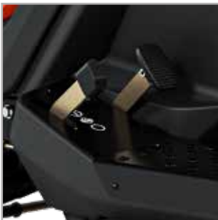
DIFFERENTIAL LOCK Provides better traction in slippery conditions (SYC122).