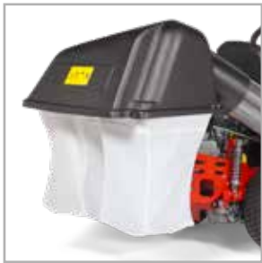
Twin bag collector