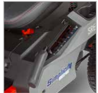
HEIGHT OF CUT Manual lever with 7 positions allows easy height adjustment ranging from 38 to 114 mm.